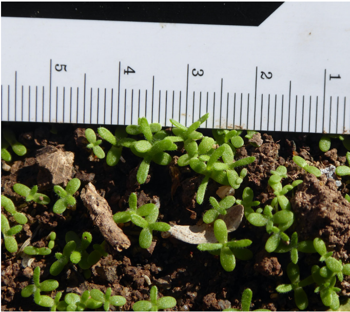
Fig. 3 Stinknet seedlings fourteen days after germination