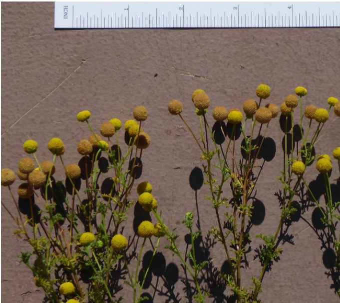
Fig. 7 Stinknet flower heads turning tan color as seeds mature