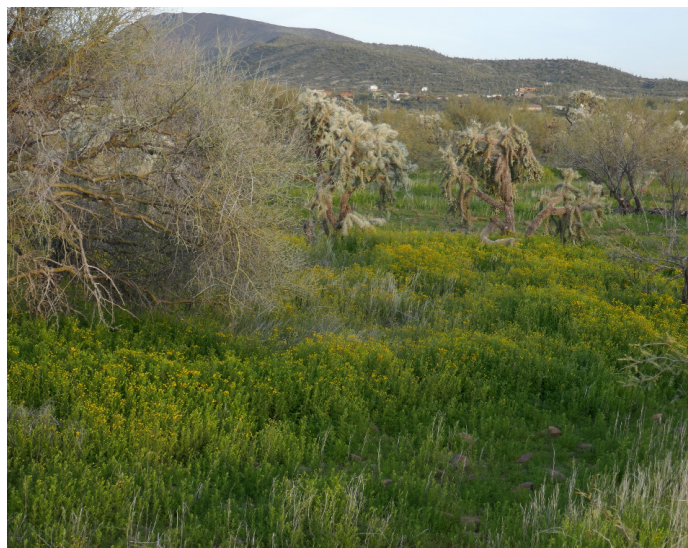
Fig. 11 Dense stinknet cover, Tonto National Forest

People differ in their reaction to the odor of stinknet, which is pungent and similar to turpentine. Some consider it pleasant while others regard it as "nauseating". Stinknet has been implicated in cases of respiratory distress. There are other reports of allergic contact dermatitis from exposure to stinknet (Baltazar et al. 2022). Stinknet's alternate name globe chamomile has led some people to believe it can be used in the manner of herbal chamomile. Some vendors at Phoenix area farmers' markets have been observed selling bundles of stinknet as "wild chamomile." The public health hazards of stinknet require further study.