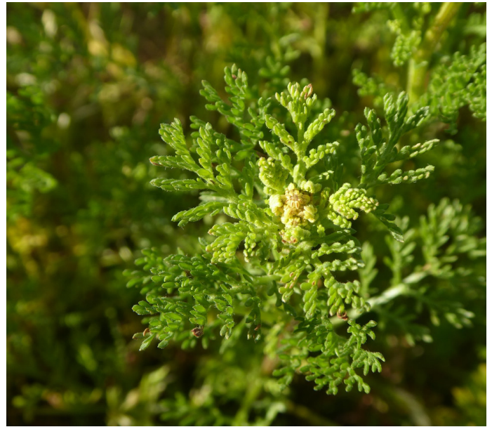
Fig. 5 Initiation of stinknet flower heads