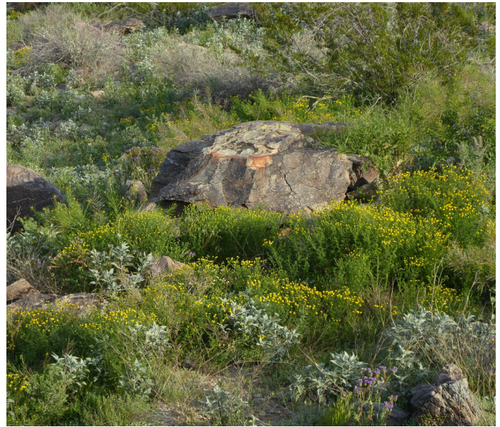
Fig. 2 Stinknet competing with native vegetation in South Mountain Park, Phoenix Arizona