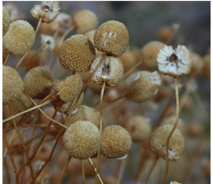
Fig. 9 Close-up of stinknet seed heads with some seeds dislodged