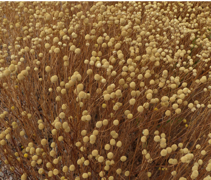
Fig. 8 Dead and dry stinknet plants with seed heads