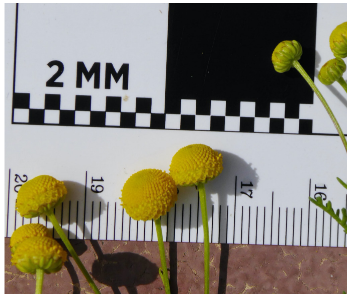
Fig. 6 Stinknet flower heads in blooming stage, with metric scale