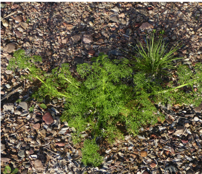
Fig. 4. Young stinknet plant with bolting stems