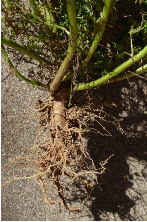
Fig. 12 Stinknet root structure

Stinknet may be pulled, uprooting the entire plant, when growing in moist or loose soil. It does not resprout from root fragments (Fig. 12). Plants must bolt before they can bloom, and this provides a handhold for pulling plants at this stage. Wearing gloves and long sleeves is advisable due to sensitivity some people have experienced from contact with stinknet.