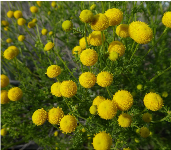
Fig. 1 Stinknet in bloom