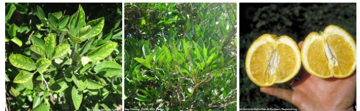
Figure 3. Symptoms of CSD: A: leaf chlorosis; B: twig dieback and leaf chlorosis; C: lopsided fruit