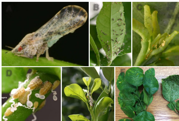
Figure 6. Asian citrus psyllid. A: adult (45° angle); B: adult feeding; C: eggs; D: nymphs with wax tubules; E: wax tubules