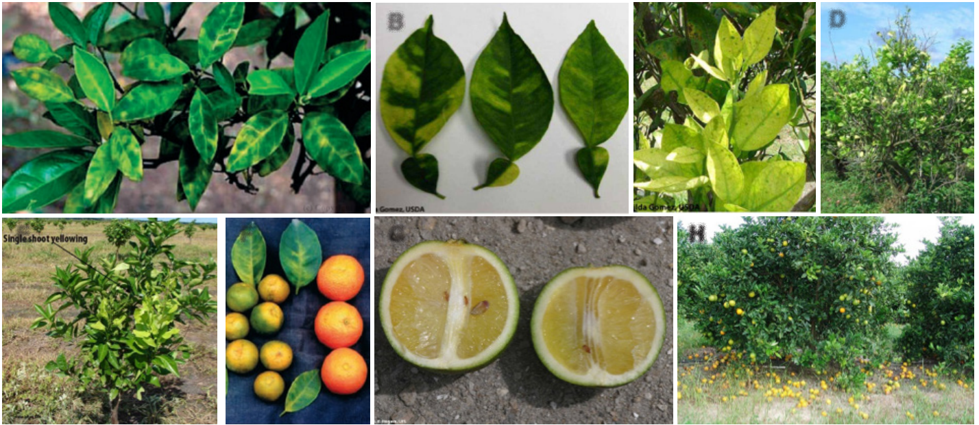
Figure 1. Typical foliar and fruit symptoms due to HLB: A: yellow vein and blotchy mottle; B: blotchy mottle; C: green island; D: twig dieback and sparse canopy; E: yellow shoot; F: smaller fruit with color inversion; G: small lopsided fruit with dark seeds; H: pre-harvest fruit drop