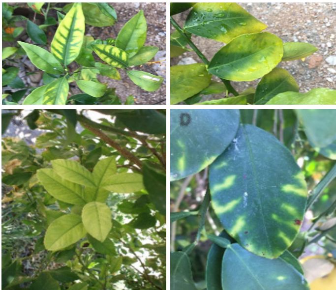
Figure 5. Symptoms of nutrient deficiency. A: zinc; B: magnesium; C: iron; D: manganese