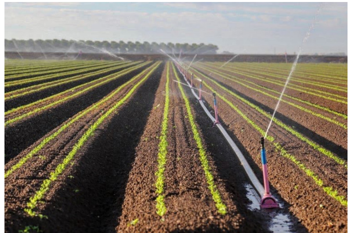
Irrigation Canal, Yuma, AZ

Various water treatment methods or technologies can be used for agricultural irrigation based on the water quality parameter of concern (e.g. bacteria, sediment, etc.). Such methods include chemical treatment, physical treatment, and biological treatment, and are illustrated in Figure 1. It is important to remember each method has advantages