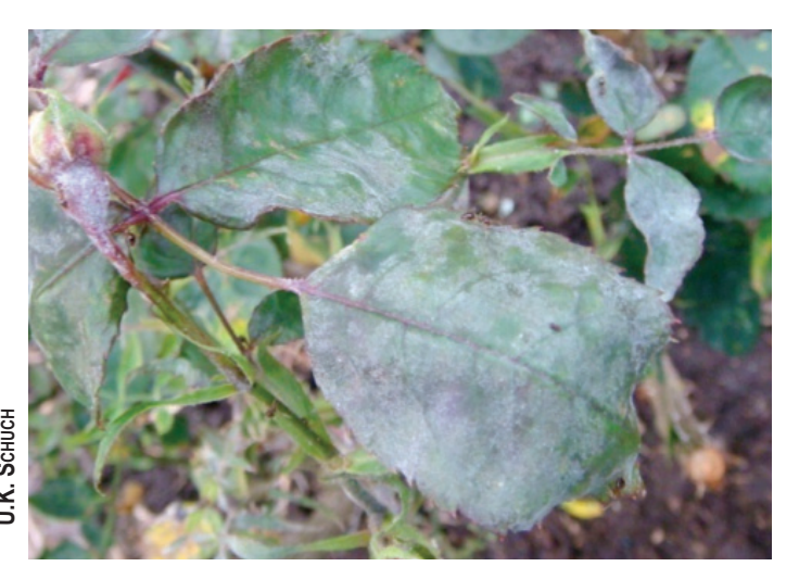
Fig. 5. Powdery mildew damage

The incidence of powdery mildew can be lessened considerably by simply using good gardening practices. When planting, provide sufficient space among bushes to allow air circulation and sunlight. Always clean up old leaves from the roses after pruning and discard them. Periodically wash down the leaves of the roses with water from the hose.