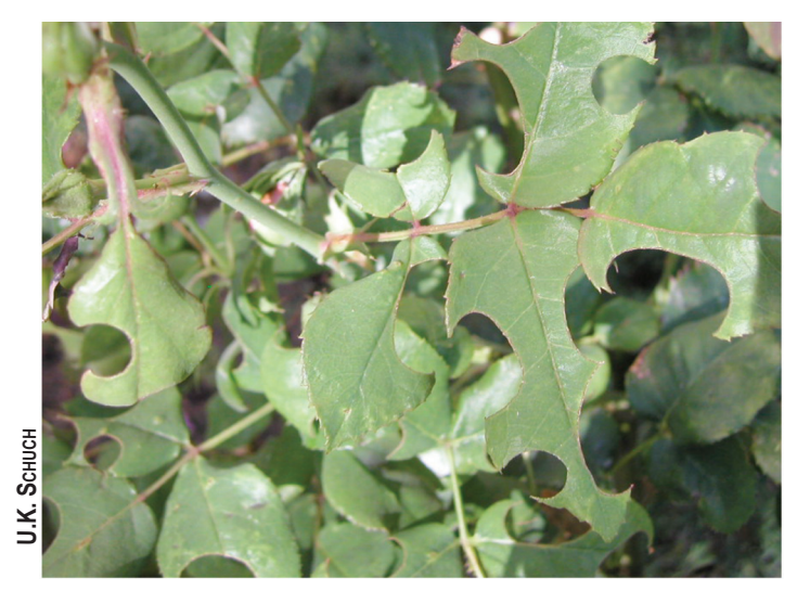
Fig. 4. Foliage damage caused by leaf cutter bee

Circular or half-moon-shaped leaf cuts are caused by leaf cutter bees (Fig. 4). This is only aesthetic damage and is not detrimental except for roses that will be entered in competitions. Many gardeners see the hole left by a leaf cutter bee as a badge of honor, a testament to the health of their garden. Since the cutter bees use the leaves to make a nest and do not ingest the plant tissue, it is impossible and unnecessary to control them with chemicals. Try covering show roses with floating row cover or cheese cloth to keep cutter bees at bay.