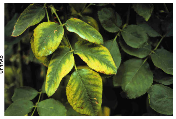
Fig. 10. Magnesium deficiency on rose

Iron deficiency, often called iron chlorosis, causes yellowing between the green veins of young leaves (Fig. 9). If this problem occurs, supply iron in a chelated form, which is more readily available for uptake by the plant roots.