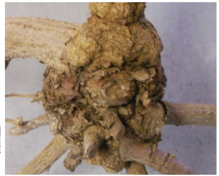
Fig. 6. Crown gall on rose stem

Due to stringent screening by many rose growers, crown gall is not commonly found in rose plantings. This destructive disease causes a warty looking gall at the base of the canes that can vary from the size of a pea to the size of a fist. (Fig. 6). Gall development causes gradual plant decline. The bacteria may arrive on contaminated nursery stock and once introduced, the bacteria persist in the soil for several years. Infection takes place through wounds. To prevent the disease, examine plants for galls carefully prior to purchase and prevent injuries during transplanting. There is no treatment. Remove and destroy infected plants. Do not replant roses, pyracantha or stone fruits in a place where crown gall is present.