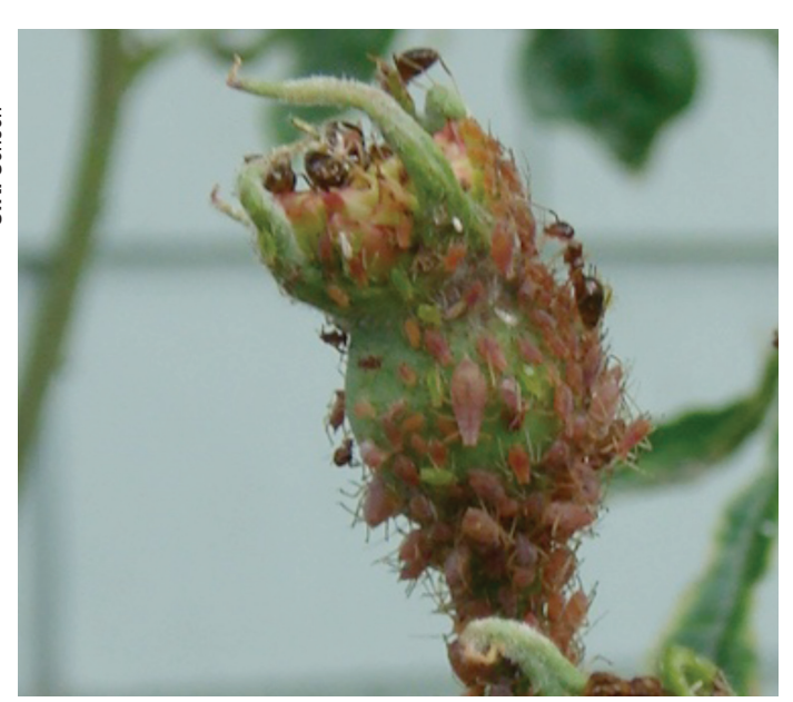
Fig. 2. Rosebud covered with aphids

When tender new growth appears on roses in February, aphids are not far behind. The rose aphid is a soft-bodied pink or light green insect that sucks the sap out of new growth and buds (Fig. 2). Aphids are best controlled with a forceful spray of water from the hose. A second line of defense is to use a soapy water spray (mix one tablespoon of dish detergent per gallon of water). Do not use a citrus based soap or scented detergents and always spray one or two leaves and check their reaction before you spray the entire plant. Spraying with water or soapy water can be repeated daily, if necessary, to control aphid populations. If you monitor the rose bushes regularly and take action as soon as aphids start appearing, it should not be necessary to use a chemical insecticide. Beneficial insects such as lady beetles and green lacewings will soon appear to feast on the aphids.