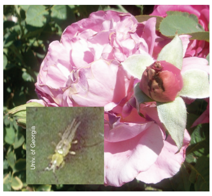
Fig. 3. Thrips damage and a thrips (insert)

As the flower buds start to form on roses, look for thrips. Thrips are slender, brownish-yellow winged insects, barely visible to the naked eye. They hide inside newly opened buds and munch on the flower petal edges, causing them to turn brown (Fig. 3). The damage is cosmetic and won't harm the bush. Some gardeners don't experience problems from thrips and report thrips are eaten by the same beneficial insects that consume aphids. Gardeners trying to cultivate the perfect blooms for competition may choose choose to use a chemical control for thrips, spraying the buds before opening (use an insecticide labeled for thrips on roses). Spray only the unopened bud, not the entire bush. Otherwise, you may destroy beneficial insects that will consume these pests.