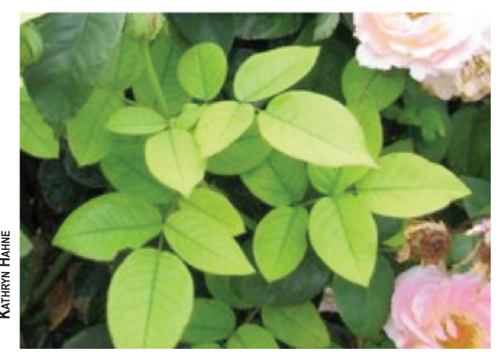
Fig. 8. Nitrogen Deficiency

Nitrogen deficiency causes a general yellowing of foliage, beginning with older leaves, then appearing on younger leaves (Fig. 8). Leaves turn light green and progressively more yellow. Reduced growth and leaf size, weak and spindly stems, and small flowers are other symptoms. Prevent a nitrogen deficiency by fertilizing regularly. However, don't apply too much nitrogen, which will show up as abundant foliar growth and very few blooms.