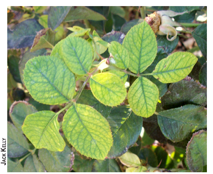
Fig. 9. Iron deficiency on rose

Iron deficiency, often called iron chlorosis, causes yellowing between the green veins of young leaves (Fig. 9). If this problem occurs, supply iron in a chelated form, which is more readily available for uptake by the plant roots.