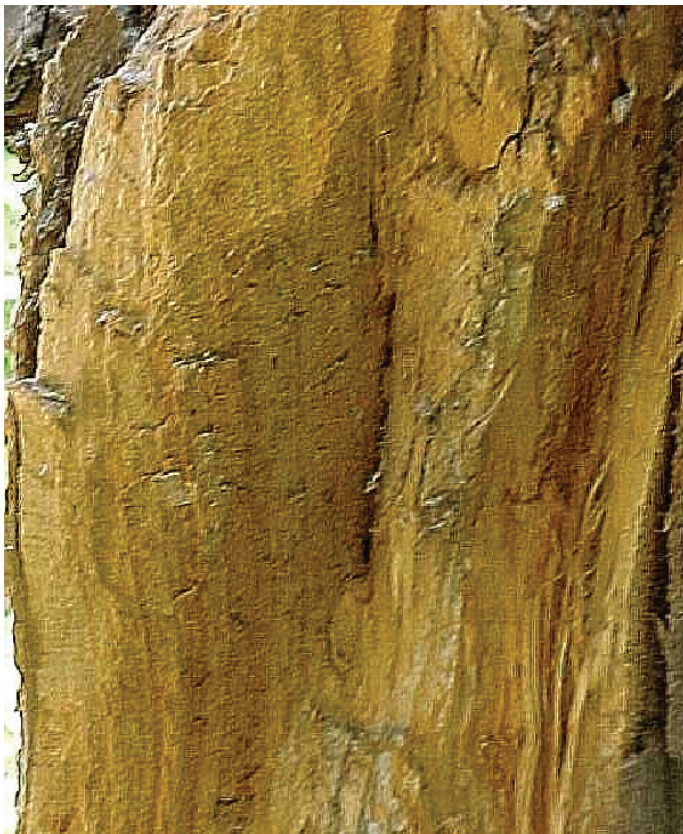
Figure 6. Diseased citrus wood with dark staining.

Diseased branches should be cut back or removed completely. If the affected branch is to be cut back, be sure that the cut is made into healthy wood. Healthy wood is whitish-yellow, the color of a manila folder. Any darker wood visible at the cut is an indication that disease still exists (Figure 6).