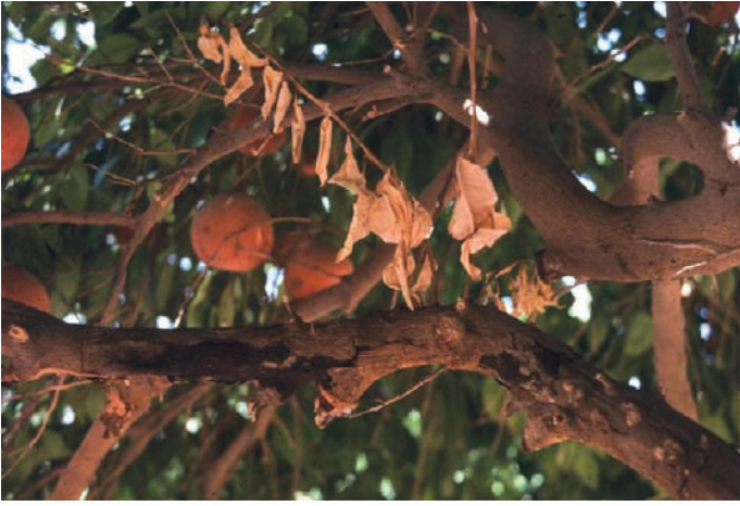
Figure 1. Hendersonula damage to citrus limbs.

to the harsh summer sun. It is not generally recommended to prune citrus from May through the middle of October since exposed limbs and trunks can be damaged by intense sunlight, possibly leading to sunscald or an infestation of Hendersonula bark rot (sooty mold); a disease for which there is no cure other than limb removal (Figure 1). We recommend summer removal of large limbs and large sprouts only in cases where damage is present, and where further delay would lead to additional injury. Whenever and wherever trunk or limbs are exposed to the sun, they should be protected with white paint (See Protecting the Tree on page 4).