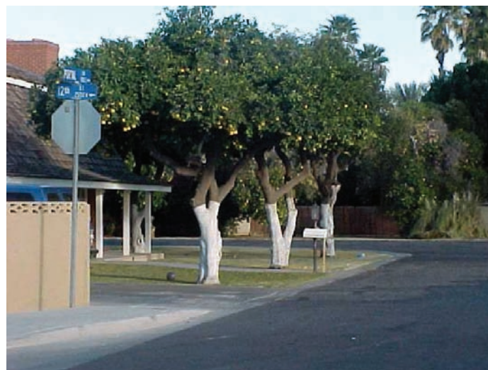
Figure 4. Skirted trees.

Pruning low-hanging branches is known as skirting (Figure 4). Skirting is often done to make the tree more aesthetically pleasing by removing branches and thus exposing the trunk. However, there is nothing wrong with allowing the tree canopy to naturally extend toward the ground, and it is very difficult to re-establish a low-hanging