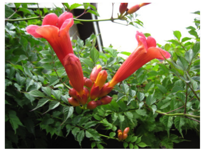
Height: 20x20 feet. Method of climbing: aerial rootlets.