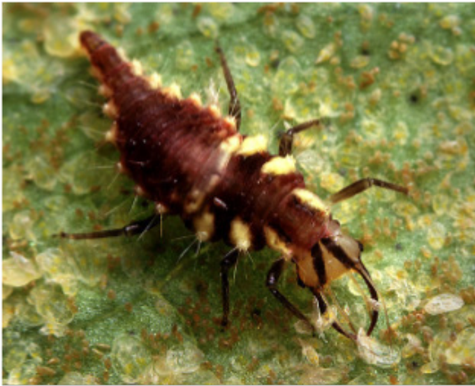
Figure 3. Green lacewing larva.