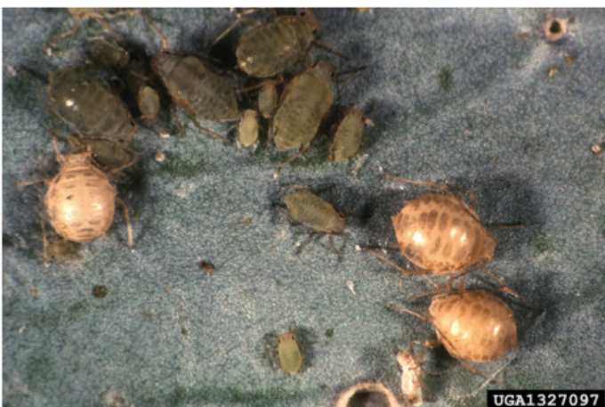
Figure 5. Aphid mummies (large and lighter in color) with healthy aphids.

to another. In this way they cultivate honeydew. Sometimes, ants will carry aphid eggs to their nest for the winter and transport them to a food plant the following spring. Another sign of aphid presence and feeding is curled, stunted leaves on new growth in the spring and shorter spaces between stem nodes. Close inspection will usually reveal the insect itself, but don't be in a hurry to use pesticides. Aphids and the damage they cause may appear unsightly; however, this damage is usually not serious and causes little long-term harm to the plants they colonize. Exceptions occur when aphids are injecting toxins or transmitting diseases through their saliva. In these cases, many of which are well documented, additional symptoms such as yellowing at the feeding site may be seen. In the case of virus transmission, there may be symptoms associated with that particular virus, such as stunted plants. Quick diagnosis and treatment may be critical to preventing economic damage where there is virus transmission.