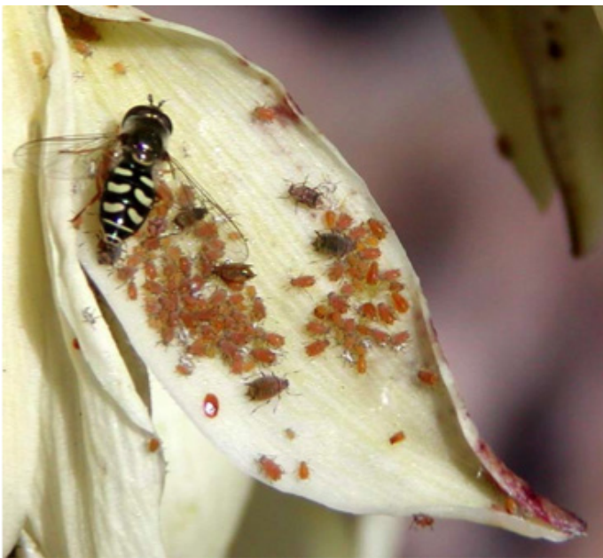
Figure 4. Syrphid fly (flower fly) on yucca with aphids.