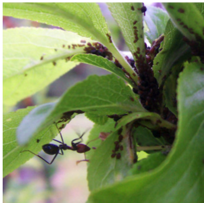
Figure 2. Ant cultivating aphids.

Photo of Illustration by USDA, Plate 2 from Insects, their way and means of living , R. E. Snodgrass.