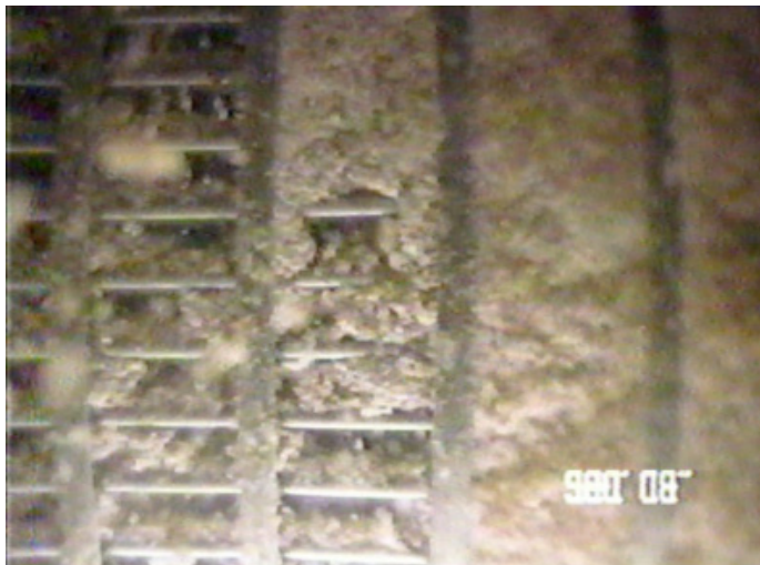
Figure 2: Scale formation on well screen.

The most common cause of a reduction in well yield is the development of scale within the well and screen, as shown in Figure 2. Similar to the deposits found inside a tea kettle, scale is the hard residue that coats the inside of pipes and the well screen as the result of precipitation of minerals composed of calcium and magnesium carbonates. Naturally occurring iron bacteria can cause plugging of the pores in the aquifer and the openings of the well screen. The bacteria produce accumulations of bio-slime within the well and increase the rate of scale precipitation, not unlike plaque buildup on your teeth. The combined effect of the growth of slime and precipitated mineral has been reported to reduce well yield by 75% within a year of well operation. (Johnson Division, 1972).