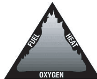
Figure 1. Fire triangle

Land managers struggle to determine to which condition a landscape should be restored — especially within the context of climate variability. Land management decisions are based on 10-year plans developed years before implementation, yet in that time frame the environmental conditions may have changed enough that the proposed management actions may no longer be appropriate. Extreme climate change may force managers to consider new management