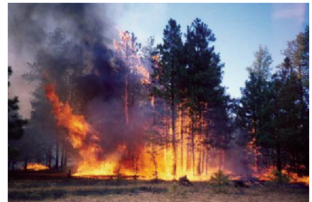
Photo series depicting a range of stand densities (low to high) and the resulting fire behavior (ground fire to active crown fire) on research plots in northern Arizona in October 1999.

Researchers in Ponderosa pine forests across Arizona are investigating what restoration alternatives are appropriate and achievable under present forest ecosystem conditions. Plots have been established at the Grand Canyon by the Ecological Restoration Institute to look at a variety of ponderosa pine stand densities and their various responses to fire (see photo series). Researchers have found that reductions in basal area, overall tree density, and density of small-diameter trees reduces the likelihood of crown torching. Fulé et al. (2001) found that thinning smaller trees followed by a prescribed fire resulted in fire behavior characterized by less canopy consumption, shorter flame lengths, and a slower rate of spread than in untreated areas.