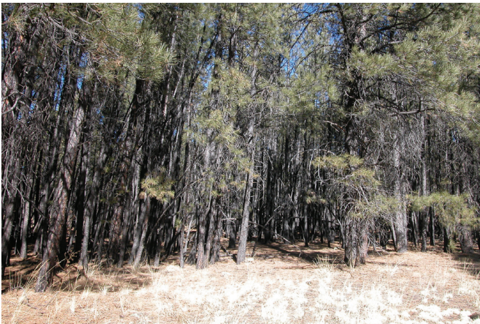
Figure 3. Open old growth pine forest near Flagstaff, AZ, circa 1900 (top). Example of present day forest conditions in northern Arizona (bottom).

practices with changing environmental conditions (for example consideration of thinning to reduce wildfire risk vs. rehabilitation following high-intensity wildfire events).