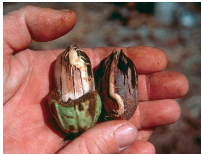
Figure 6. Vivipary or pre-germination

viviparity, such as ‘Cheyenne’ and ‘Pawnee’. With varieties with potential vivipary problems in the low desert areas, like “Wichita” and “Western Schley”, try harvesting the nuts just after the kernel matures but before germination begins. These nuts are harvested early before they have a chance to dry naturally on the tree and are called “green harvested” nuts. They will need to be removed from their husks and dried separately to prevent mold and mildew from forming on the nut shells.