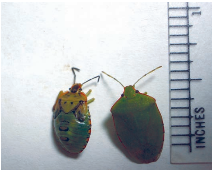
Figure 9. Stink Bugs