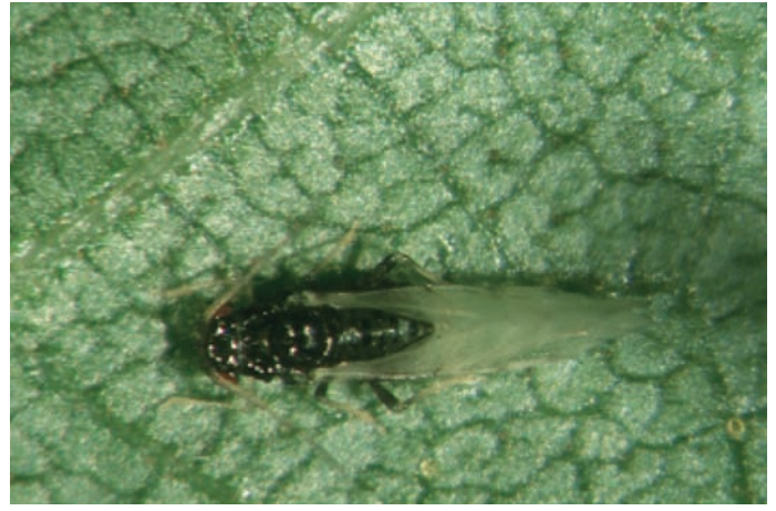
Figure 8. Black pecan aphid ( Melanocallis caryaefoliae (Davis))