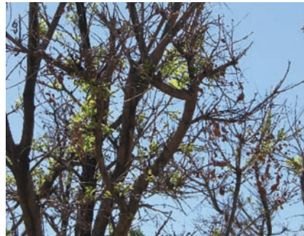
Figure 2. Severely zinc deficient tree.