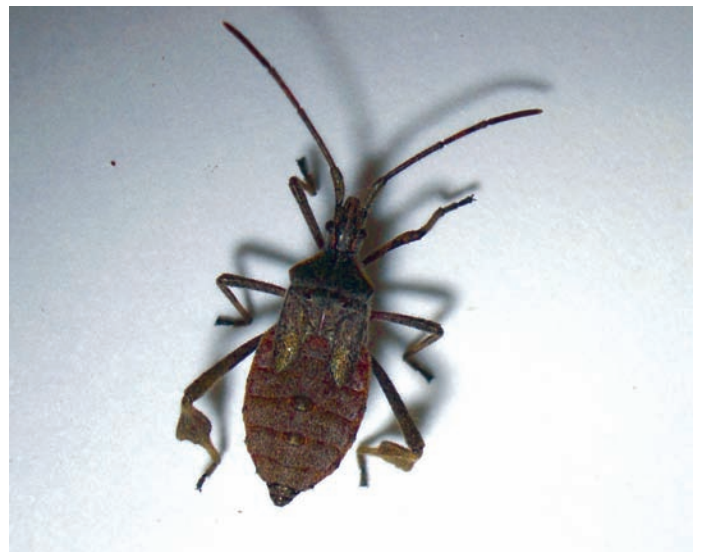
Figure 10. Leaf-foot Plant Bug