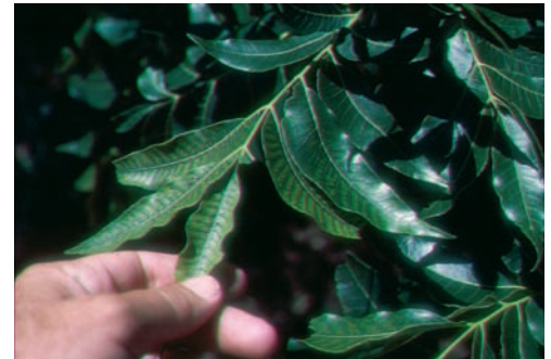
Figure 3. Zinc deficiency causes small leaflets.

cases has to be sprayed on foliage as a supplement to soil application. Spraying may be difficult with large trees or prohibited by cost, necessitating soil applications. The zinc source for spraying is zinc sulfate (36% zinc), or liquid zinc nitrate (17% zinc). Some liquid zinc formulations are sold that also contain liquid iron. DO NOT use zinc chelates as a zinc source for foliar or soil applications. Chelates are low in zinc (about 7-10%), and expensive. Chelates are not recommended because they do not supply enough zinc to satisfy pecan tree requirements. In addition the chelated molecule is large and is not absorbed very well by leaves and/or roots.