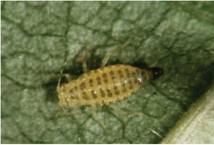
Figure 7. Yellow pecan aphid ( Monelliopsis pecanis (Bissell))