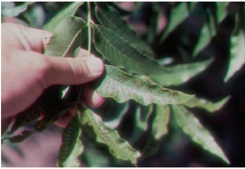
Figure 1. Zinc deficiency causes brown spots between leaf veins.