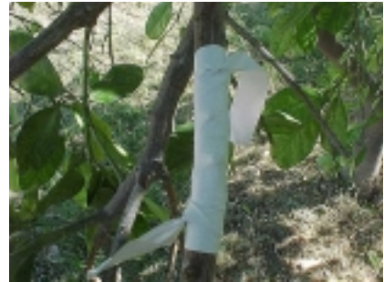
Figure 8. Bud completely wrapped in tape.