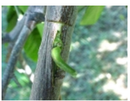
Figure 7. Bud in pocket.

Carefully slip the scion bud beneath the bark flaps. Push the bud down into the pocket so that the flaps cover the bud completely, and the bud fits tightly within the pocket (Figure 7). Orient the bud in the same direction that it was oriented on the budstick.