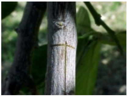
Figure 4. Vertical cut on the rootstock.

If the bark does not slip easily, this indicates that the stock is not undergoing active growth and budding should be conducted later when active growth has resumed.