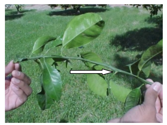
Figure 2. Fresh cut citrus budwood. Arrow points to the location of the bud on the branch.