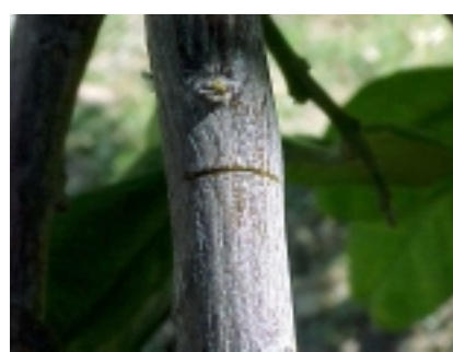
Figure 3. Horizontal cut on the rootstock.

To prepare the budding location, make a horizontal cut on the stem of the rootstock (Figure 3). The cut should be deep enough to insure that the bark will peel away from the interior wood. The "T" is then made by a vertical cut (Figure 4). The bark is carefully peeled from the stem of the rootstock exposing a "pocket" into which the scion bud can be placed. Care should be taken not to tear the flaps of bark in the process of spreading them.