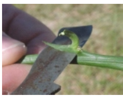
Figure 6. Cutting under the bud with the knife.