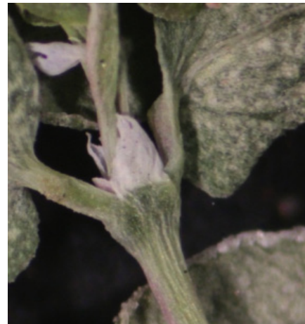
C. albomarginata . the fused stipule is a diagnostic character.