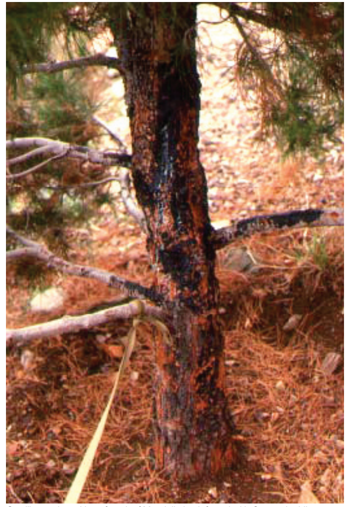
Swelling and cracking of trunk of Mondell pine infected with Comandra blister rust.