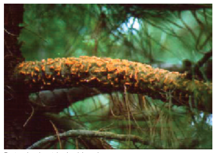
Rusty colored pustules (aecia) on pine