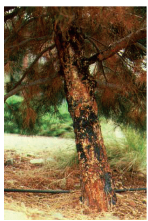
Comandra blister rust on Mondell pine.

Like many rust fungi, Comandra blister rust is a very specialized pathogen. It requires two specific hosts (pine and Comandra ) to complete its life cycle and has five different spore forms. Infection occurs in pine needles after rains in late spring or after the summer monsoon in late summer by spores (sporidia or basidiospores)