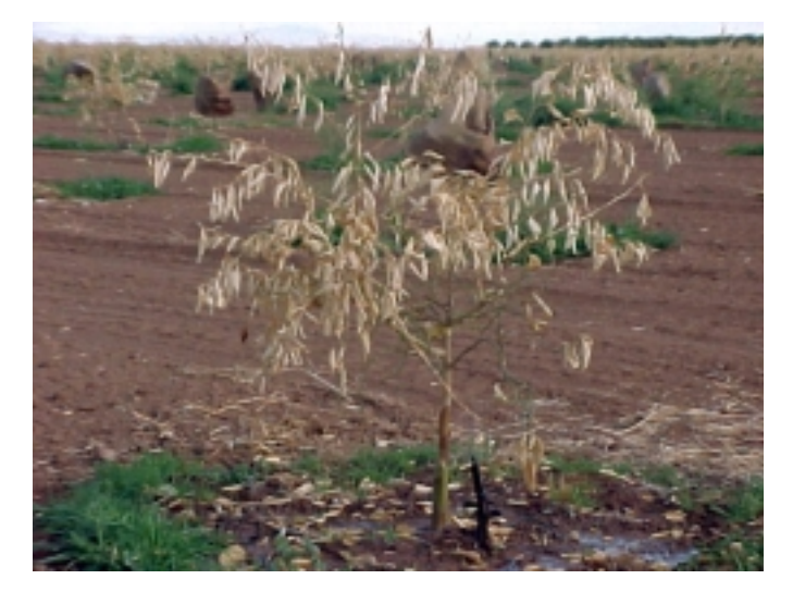
Figure 4. Frost-damaged navel orange tree.

Sometimes, despite the best efforts of the gardener, a tree will be damaged by frost (Fig. 4). Cold-damaged fruit will appear water-soaked on the inside, sometimes without exterior evidence of damage. One to two weeks later, the rind will separate from the segments and the fruit will become soft and puffy. Finally, the segments will dry and the fruit will become pithy. Damaged fruit may often be juiced if harvested quickly after the frost. Fruit in the warmer interior of the tree are likely to be less damaged than those on the outside.