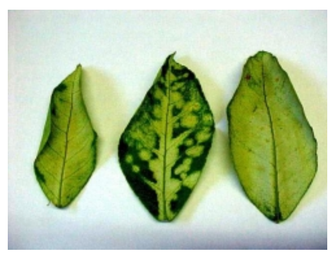
Figure 5. Frost damaged lemon leaves.

It is best to wait to determine the extent of the damage to branches and trunks before pruning, since it is sometimes difficult to distinguish between dead wood and living wood. Prune out the dead wood after the spring growth flush shows the extent of the damage. If trees must be pruned sooner than the growth flush, because damaged trees are unsightly, go back and remove additional dead wood throughout the season.