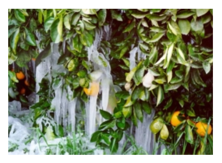
Figure 3. Ice-draped orange tree after a recent freeze in Central California

Trees should be sprinkled with water throughout the frost. As the water freezes around the leaves and branches, it will liberate enough heat to maintain the tissue temperature at 32°F. This strategy will only be successful if the water is flowing continuously throughout the frost, and if it remains flowing until the air temperature is above 37°F. Only the leaves that are sprinkled will not suffer freeze damage, although there could be some limb breakage due to accumulation of ice (Fig. 3).